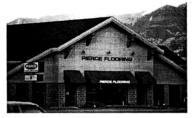
Figure 3. The phony western architectural style promoted by design guidelines.

The third reason that the buildings fail to define the street is the attention the DOPEC guidelines give to architectural style. The guidelines incorrectly suggest that Bozeman's character is created by a western-style of buildings with distinct rooflines, steeply pitched roofs, and deep roof over-