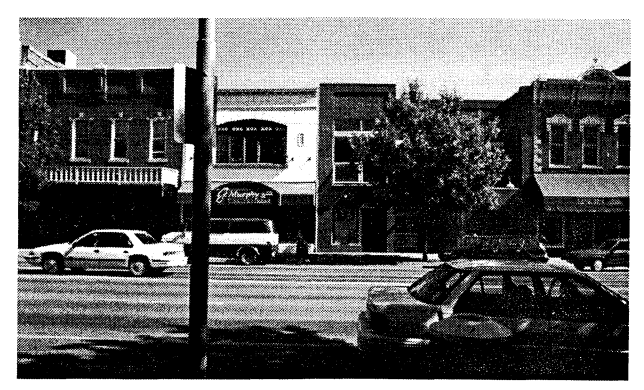
Figure 2. Main Street Bozeman

The sixth element is the provision of civic functions in prominent locations. Civic buildings enable indoor public life in the same way that parks and town squares enable outdoor public life. Inclusion of civic buildings within our neighborhoods provide symbols of community identity. Civic buildings, such as churches, schools, monuments, and libraries, can organize or mark significant places in the